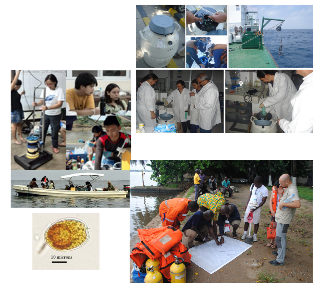
Clockwise from top right: Latin America project sampling in Colombia; N-W Africa group planning the deployment of a tide gauge in Ivory Coast; Heterosigma akashiwo sampled by the Indian Sub-Continent Project at Dona Bay, India; SE Asia project sampling in Philippines

Monitoring coastal erosion and hydrodynamics of Northern and Western Africa.